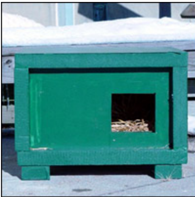
Neighborhood Cats Winter Shelter

This is another feral cat house courtesy of Neighborhood Cats. http://www.neighborhoodcats.org/info/wintershelter.htm