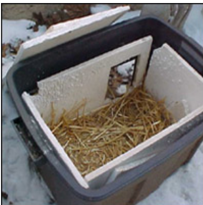
The CSM Winter Shelter

http://www.neighborhoodcats.org/info/wintershelter.htm